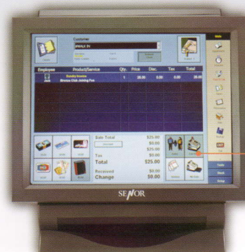
12.1" / 15" TFT LCD with Touch Screen